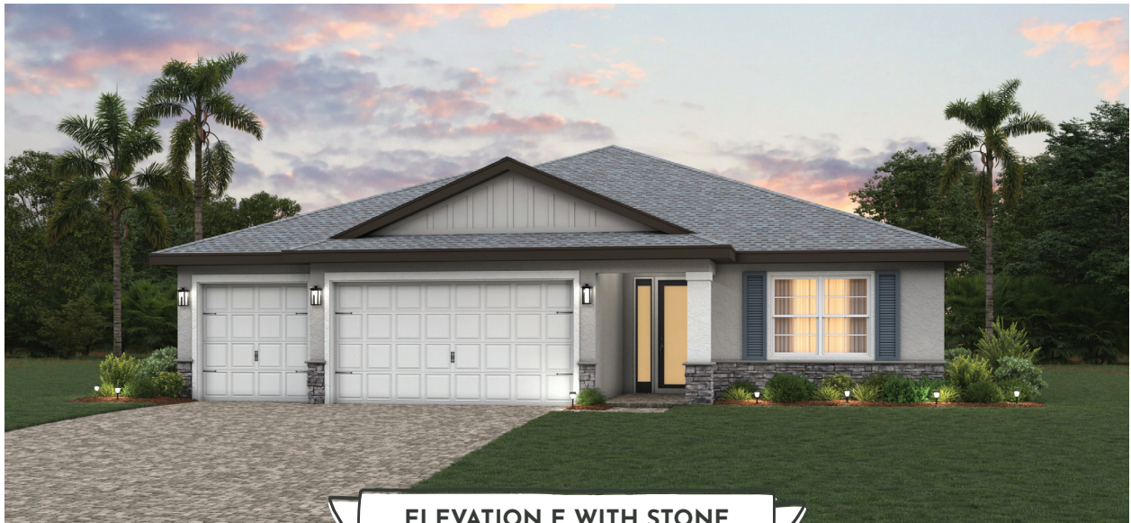
ELEVATION E WITH STONE