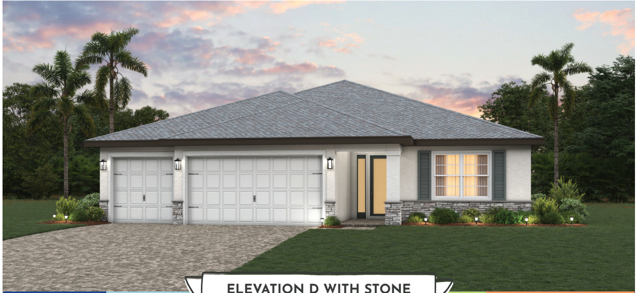
ELEVATION D WITH STONE

4 beds • 3 baths • 3-car garage • 2,205 sf a/c