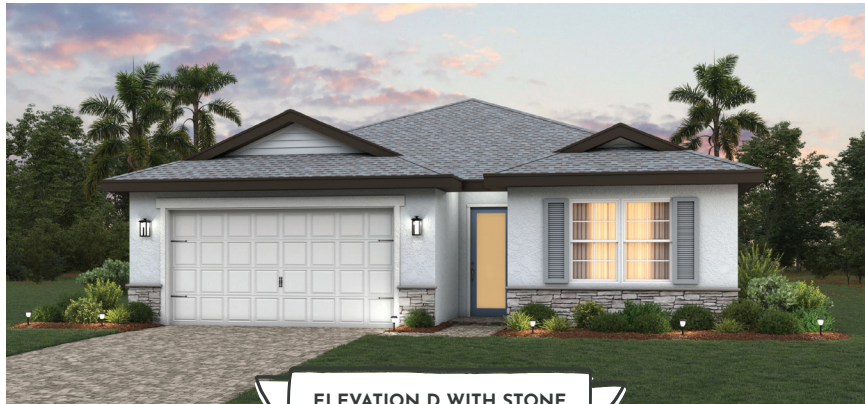
ELEVATION D WITH STONE

4 beds • 2 baths • 2-car garage • 1,810 sf a/c