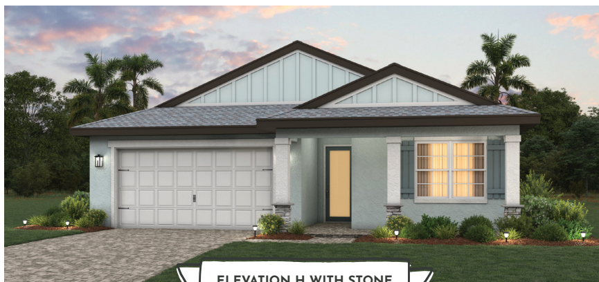
ELEVATION H WITH STONE