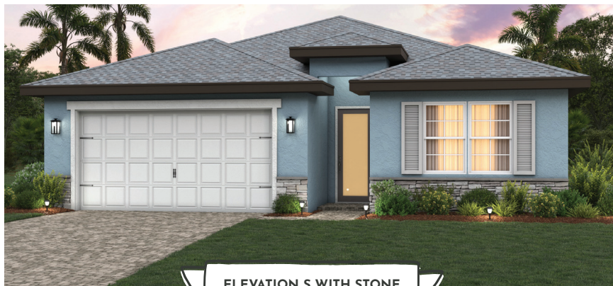
ELEVATION S WITH STONE